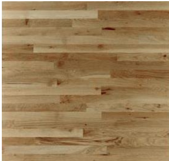
#1 Common White Oak