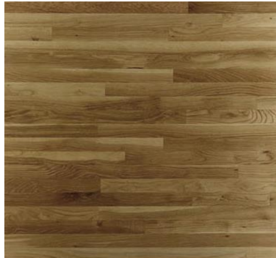
Select White Oak