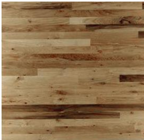
#2 Common White Oak