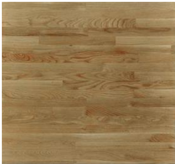
Clear White Oak